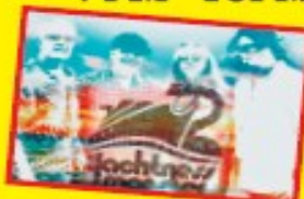
FRIDAY Yachtress Monster