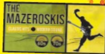
SATURDAY The Mazerokis

FIREWORKS Presented By SATURDAY AT DUSK! PYROTECNICO